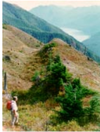
A hiker enjoys a panoramic view of the Sol Duc Valley and Lake Crescent.

PASS REQUIRED: A NW Forest Pass or Golden Passport is required on each vehicle parked at trailhd. Day & Annual NW Passes are available at FS offices and vendors but not available at trailheads.