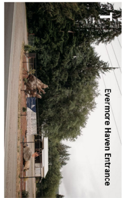
Evermore Haven Entrance